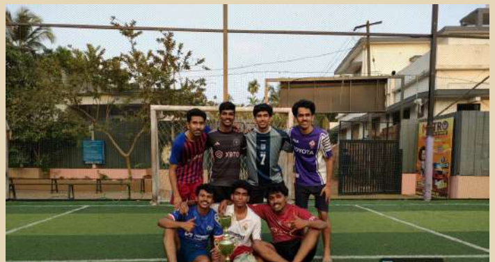
Team Alpha secured first place in the Jwala '26 football match